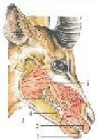
Image from: Impalas are found in the grasslands of central... in Philip's Encyclopedia