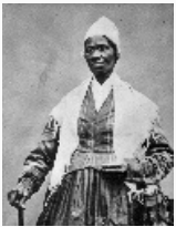
Image from: A charismatic evangelist for abolition. Sojourner... in The Underground Railroad: An Encyclopedia of People, Places, and Operations

Born to slave parents in Philadelphia, he bought his freedom, became an itinerant preacher, and at the age of 27 founded the Free African Society of Philadelphia, the first organization of free African-Americans. He was spiritual leader of the first African Methodist Episcopal Church, and served as its bishop from 1816 to 1831. Throughout his life in Philadelphia, Allen worked as a leader in many African-American institutions to improve the lives of newly freed slaves.